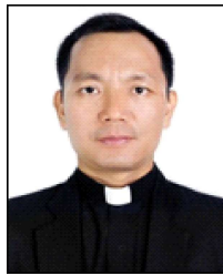
By: Fr Paul Lelen Haopik

World Tourism Day is observed each year on 27 September to foster the significance of tourism and its social, cultural, political, and economic values. It is high time to re-think tourism that is socially and culturally sustainable. Tourism is a win-win social interaction principle, of course, with a flipside. While possible economic progression is a motivating factor, we must seriously consider tourism's socio-cultural implications. Northeast India has many motivating features for tourism, but the infrastructure is poor compared to other well-established tourist places. While Northeast India remains an unexplored part of India, it is the corridor