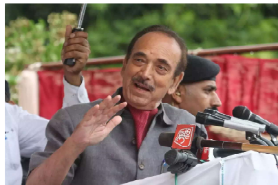
Agency Srinagar, Sept 26:

A month after he quit the Congress party, former Jammu and Kashmir chief minister Ghulam Nabi Azad announced the name of his party as the 'Democratic Azad Party'. He addressed a press conference and said that his party received around 1,500 suggestions in Urdu as well as Sanskrit.